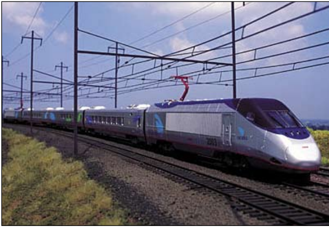
Figure 4. Acela Express train.

~17% through the use of regenerative braking. In all these systems, the use of aluminum technology enables extremely low axle weight and good exploitation of passenger space, all without compromising structural integrity and safety. 11