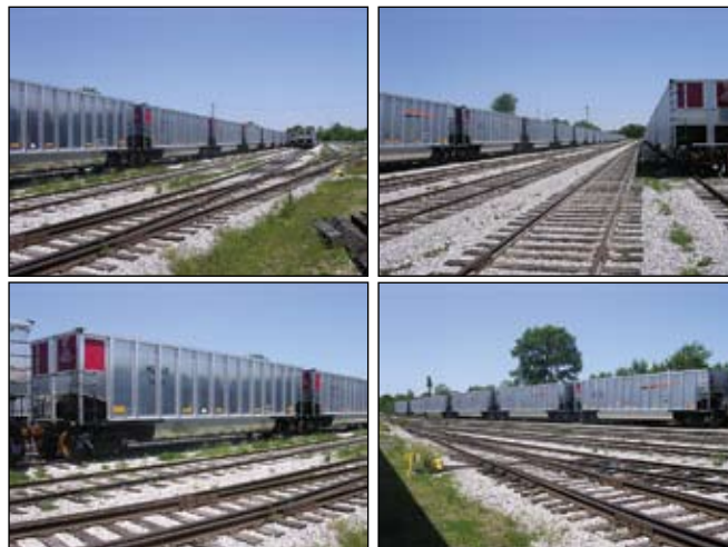
Figure 1. Aluminum intensive open-top hopper cars.

Freight Applications: One of the most significant applications of aluminum in rail has been in the development of freight cars for the transportation of a range of commodity materials, especially coal. Typically, rail cars are designed for a 30-year life, and materials developments have tended to evolve gradually. 3 However, much of the existing rail stock is now approaching the end of its original design life. This, together with the recent high demand for the transport of low-sulfur coal from the western mines to the eastern markets, has caused a boom in the construction of coal cars. An article in American Metal Market (AMM) 4 forecast that deliveries of railcars will approach some 60,000 units per year by 2009 and projected a 50% growth in coal car deliveries over the five years starting in 2005. In a more recent article, AMM estimated that some 27% of these cars will be aluminum. The lighter aluminum railcar bodies, about two-thirds the weight of the comparable steel body, enable a greater payload. The higher payload capacity repays the higher initial cost of aluminum in less than two years, and the resistance of aluminum to corrosion by the high-sulfur coal ensures long durability for these coal cars. In addition to the operational advantages, the U.S. DOE has reported that the conversion of coal cars to aluminum has facilitated a significant decrease in the total CO 2 emissions produced by the transportation