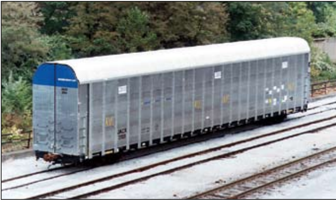
Figure 2a. Aluminum Vehicle Carrier (AVC).

longer-term benefit is that through an AAR exemption, the aluminum superstructure never needs recertification over its extended life span.”