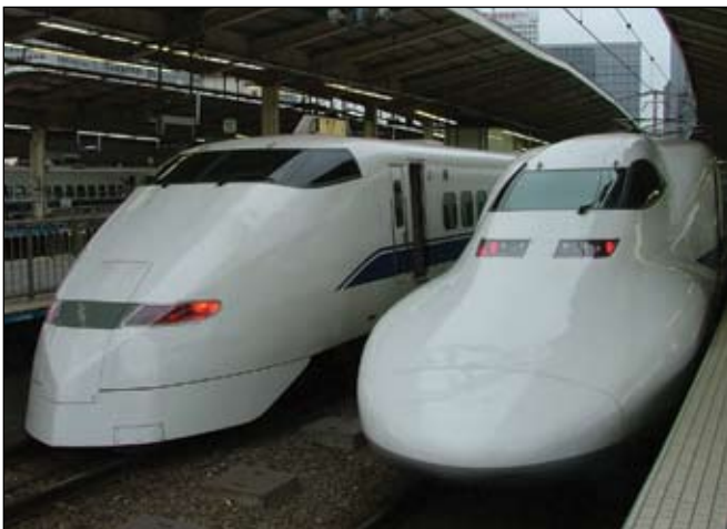
Figure 5. Shinkansen 300 (left) and 700 Series at Tokyo Station.

Advanced High Speed Trains: For the purposes of this article, these are advanced trains that require extensively modified high speed tracks for their operation or totally new redesigned track, as is the case for the magnetic levitation (Maglev) technology. These high speed trains are under development in Germany (Transrapid) and Japan (MLX01 as a successor to the existing Shinkansen). The existing Shinkansen (Figure 5) has developed a double decked version and increased its speed from 220 to 270 km/hr. This was feasible without overloading the wheel bogie assembly through lightweight aluminum construction technology.