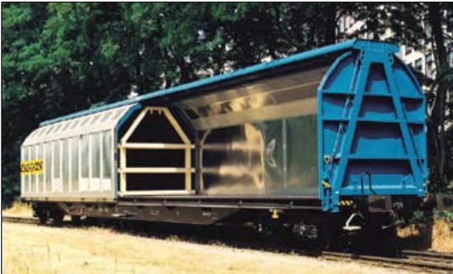
Figure 2b. High capacity railcar with sliding aluminum sidewall.

One of the most significant advantages of aluminum is the application of internally-stiffened large hollow extrusions to fabricate moveable side walls for freight cars. As compared to conventional steel walls, this type of design enables the wall to be fabricated with many fewer parts, reducing the extent of welding required, and is significantly lighter, which has the further advantage that the wall can be manipulated by a single worker, thereby saving labor. The 6xxx series alloys (aluminum-magnesium-silicon) normally used for this application offer excellent extrudability, as well as moderate strength and high corrosion resistance, and as a result the wall can be used unpainted and the cut ends of extrusions need not be sealed. The overall aluminum side wall is virtually maintenance free (Figure 2b). 9