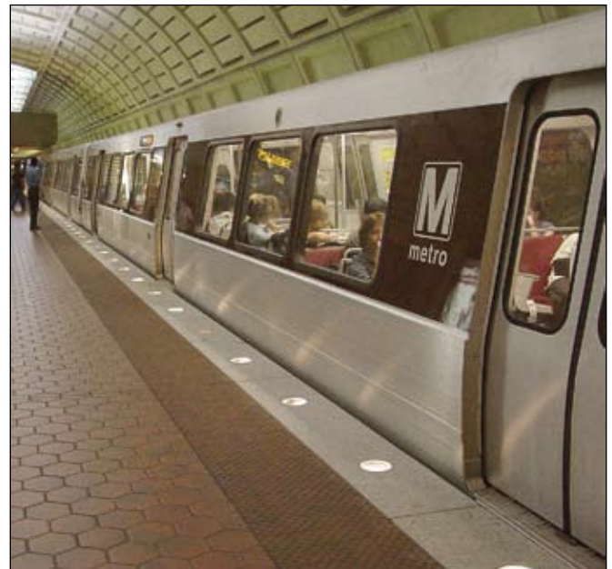
Figure 3. DC Metro train.

This weight reduction is especially significant for commuter trains with frequent stops as it enables energy savings in service and reasonable acceleration between stops (Figure 3). The other advantages of aluminum in durability and corrosion resistance also provide low maintenance costs and long system life.