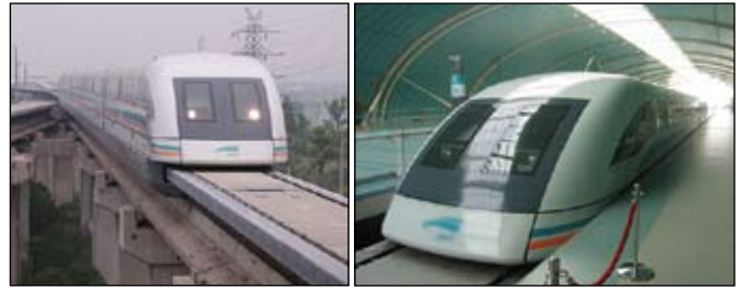
Figure 6. Shanghai Maglev.

The Transrapid, which uses aluminum alloys 6061 and 6063, is designed for speeds in the range of 400-500 km/hr while the Japanese MLX01 version is planned to operate at speeds of 550 km/hr. On a test track the Japanese Railway Maglev train is reported to have achieved a speed of 581 km/hr. As would be anticipated, at these design speeds, there is a premium on light weight structures. Aircraft and aerospace construction technology is increasingly being adopted. In addition to the use of longitudinal extrusions, there is considerable use of sheet material for foamed core panels for side wall and panel construction. The Maglev system closest to full scale operation and with most operational experience is in Shanghai, China (Figure 6). Here the system operates