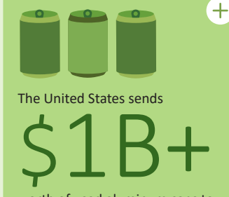
worth of used aluminum cans to landfills every year that could otherwise support U.S. production.

Today, recycled aluminum makes up more than 80% of U.S. production. We must improve recycling collection, sorting and re-melting for domestic production to meet increasing global demand.